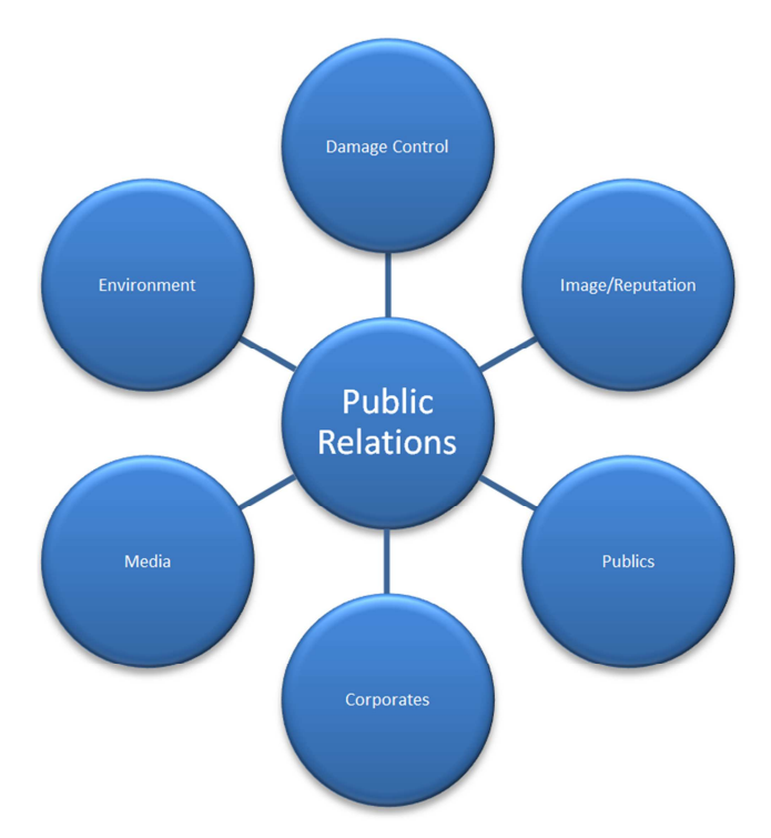
Figure 1. Broad areas of Public Relations.

Audiences are nondescript and heterogeneous or passive recipients of messages while publics are actively-engaged people or segments of audiences with particular interests and who are affected directly or indirectly by an incident during an emergency such as COVID-19 [27, 29]